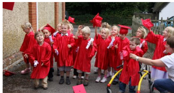
Longparish playgroup class of 2011.